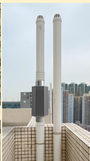
Simulated pictures of the proposed sterilizers installed at URA's sites