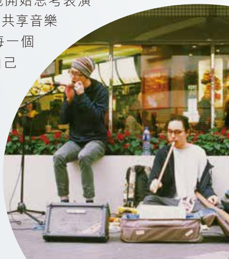
腔棘 Coelacanth 街頭表演

有了受眾與發佈途徑，他開始思考表演的意義，希望把無界限的共享音樂帶給每一個人。他深信每一個人，其實也可以表演給自己聽。在學校學到的知識，例如剪接、聲音處理、電腦編曲等技巧，也有助他和他的音樂，連繫到更遠的地方。