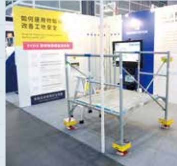
演示具有 IoT 功能的新型監察設備能怎樣提高臨時工程安全性的模型 Demonstration Model Showing How Novel IoT-enabled Monitoring Devices Can Improve Safety of Temporary Works