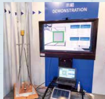
示範新型設備如何量度荷載分佈 Demonstration of Load Distribution Measured by the Novel Devices