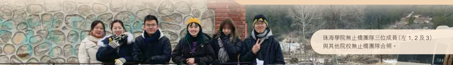
珠海學院無止橋團隊三位成員（左 1, 2 及 3）與其他院校無止橋團隊合照。

緣分就是這麼的奇妙，原本大家天各一方，但因為「無止橋」，在沒有城市燈光的天空下，既領悟到團隊的真諦，亦慢慢熟悉對方。