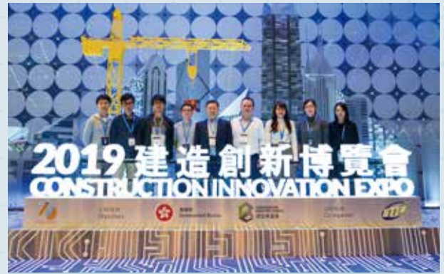
珠海學院與創新建築科技有限公司的研究團隊 The CHCHE-LR Research Team