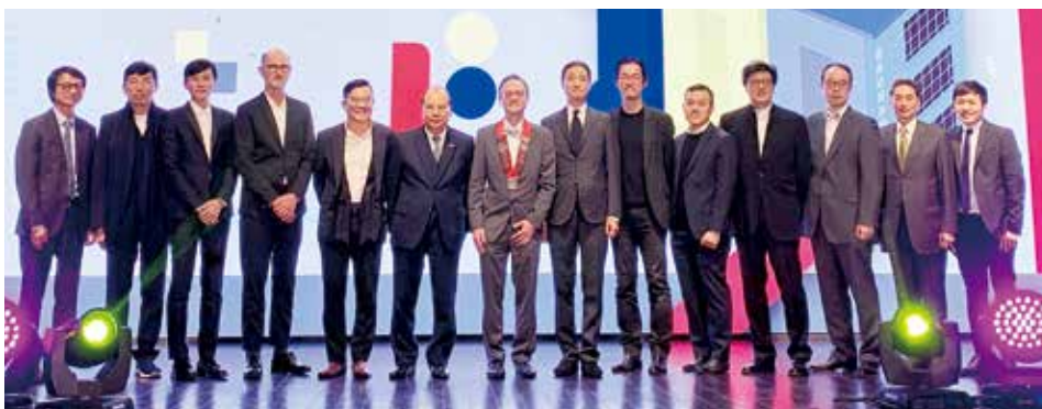
與政務司司長張建宗大紫荊勳賢合照 Group photo with HKSAR Chief Secretary for Administration Mr. Matthew Cheung Kin-chung, BGM.