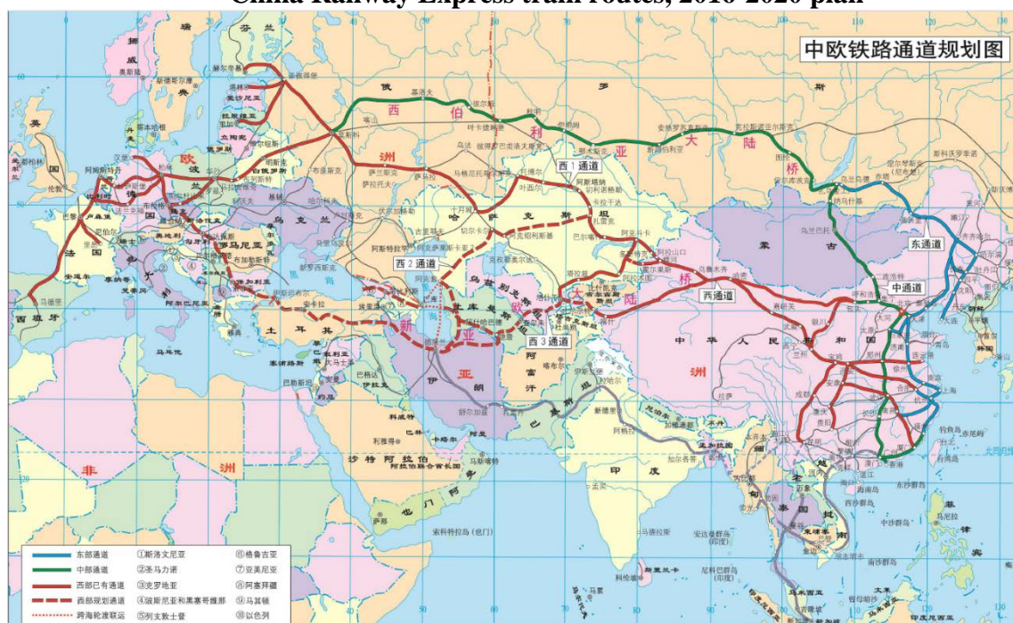
China Railway Express train routes, 2016-2020 plan