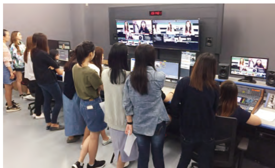
新聞及傳播課程同學進行電視新聞節目製作練習。 JCM students practice TV News Production.