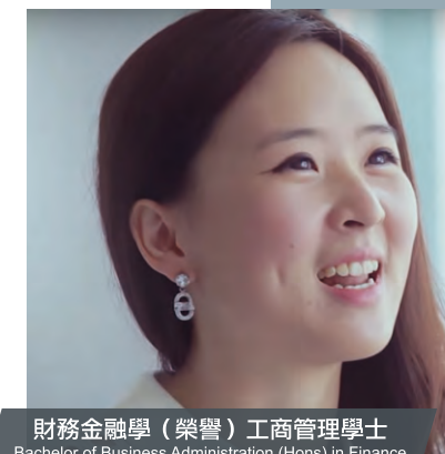
財務金融學（榮譽）工商管理學士 Bachelor of Business Administration (Hons) in Finance