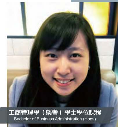
工商管理學（榮譽）學士學位課程 Bachelor of Business Administration (Hons)