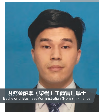
財務金融學（榮譽）工商管理學士 Bachelor of Business Administration (Hons) in Finance