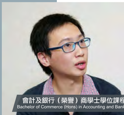
會計及銀行（榮譽）商學士學位課程 Bachelor of Commerce (Hons) in Accounting and Banking