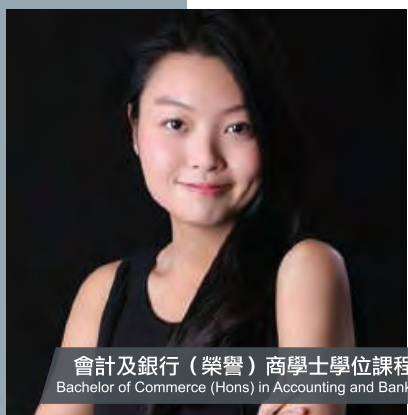
會計及銀行（榮譽）商學士學位課程 Bachelor of Commerce (Hons) in Accounting and Banking