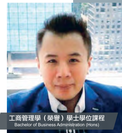
工商管理學（榮譽）學士學位課程 Bachelor of Business Administration (Hons)