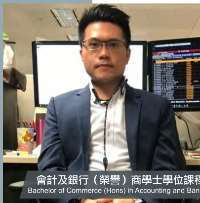
會計及銀行（榮譽）商學士學位課程 Bachelor of Commerce (Hons) in Accounting and Banking