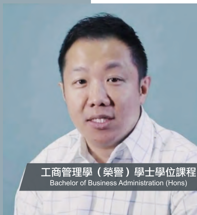
工商管理學（榮譽）學士學位課程 Bachelor of Business Administration (Hons)