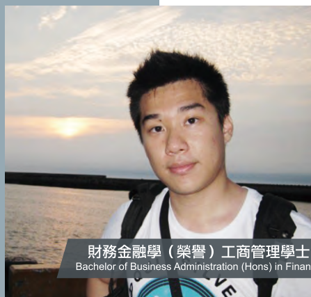
財務金融學（榮譽）工商管理學士 Bachelor of Business Administration (Hons) in Finance