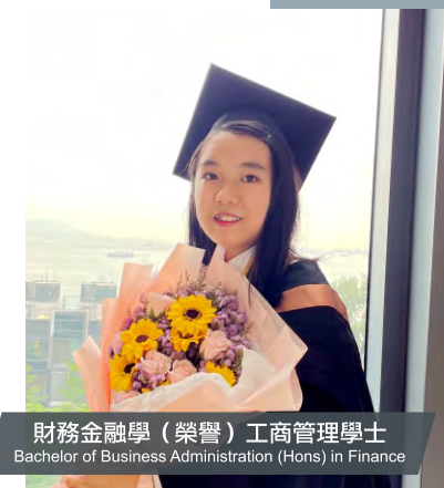
財務金融學（榮譽）工商管理學士 Bachelor of Business Administration (Hons) in Finance