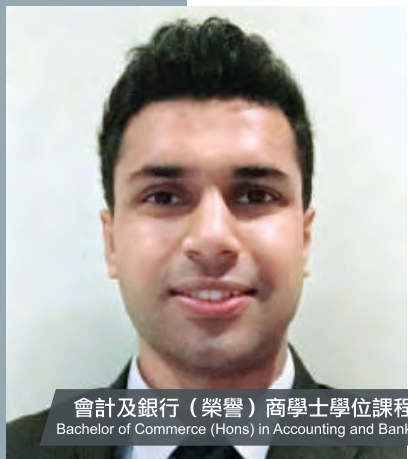
會計及銀行（榮譽）商學士學位課程 Bachelor of Commerce (Hons) in Accounting and Banking