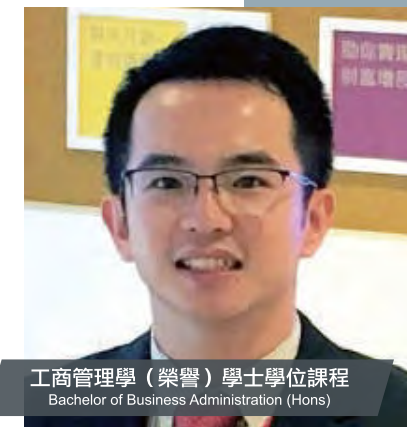
工商管理學（榮譽）學士學位課程 Bachelor of Business Administration (Hons)

A graduate of 2013, now working as a Learning and Development Officer at ImagineX Group. “The 4-year BBA programme was neither easy nor difficult for me. The programme is a good balance between theory and practice and it enables me to apply theoretical knowledge to my work. After graduation, I joined the field of Training and Development. As a corporate trainer, I’m confident with my competence to overcome challenges and be convincing at work.”