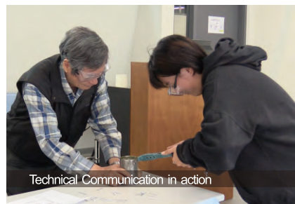
Technical Communication in action