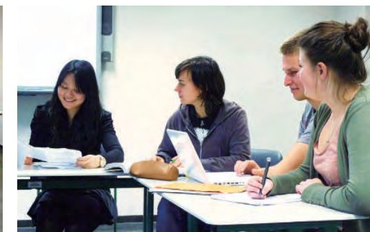
Group discussion in class