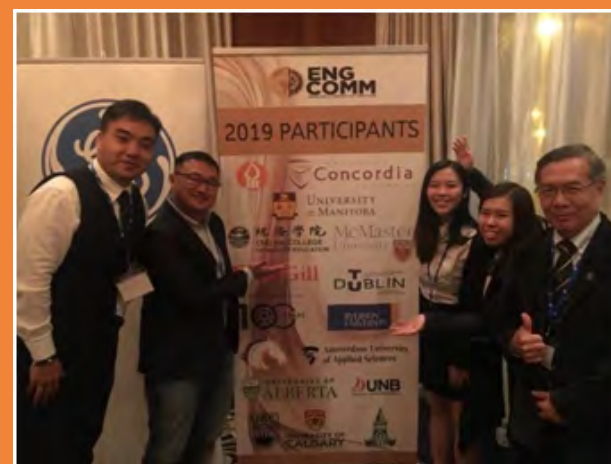
The Chu Hai team getting ready for the Engineering and Commerce Case Competition 2019 in Montreal

The College offers different types of student exchange programmes to provide students with international exposure and global outlook.