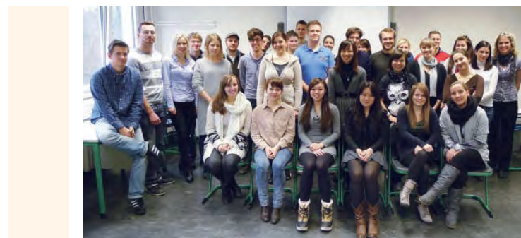
Sociolinguistics class photo at Potsdam University