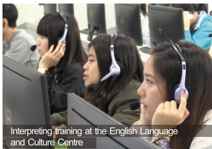
Interpreting training at the English Language and Culture Centre

Students work closely with their teachers, often on a one-to-one basis. This highly interactive and personal approach creates a harmonious learning experience.