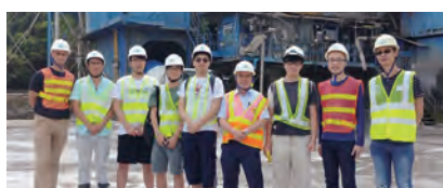
預製混凝土廠 Ready Mix Concrete Park