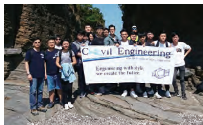
東平洲地質實地考察 Tung Ping Chau Geology Field Trip