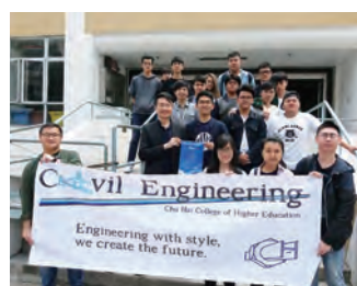
輝固土力工程 及檢測有限公司 物料研究及 檢測部 Material Lab