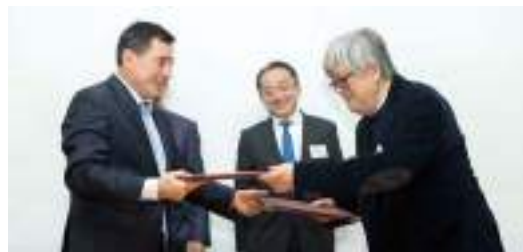
MOU signing ceremony on 10 January 2018 2018 年 1 月 10 日舉行的諒解備忘錄簽署儀式

今年度，研究所與烏茲別克總統領導的戰略及區際研究所簽訂了一項為期五年的合作備忘錄。研究所將在 2019 年與烏克蘭基輔塔拉斯·舒夫真高國立大學國際關係研究所簽訂另一項備忘錄。