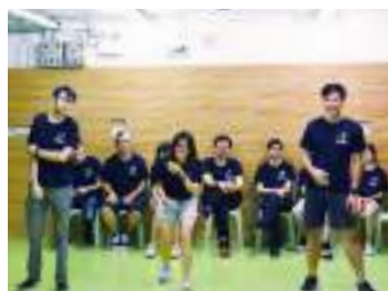
Freshmen and senior-year students develop relationship from various games in the camp 新生及師兄師姐從遊戲中建立友誼