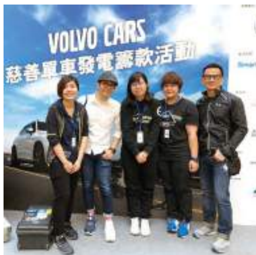
JAC students take part in a CORPCOM project in a real PR and promotion context

「山地興」陳振興及「鐵血女車神」黃蘊瑤兩位前香港奧運單車代表亦出席用行動支持。感謝一班義工及熱愛單車的朋友到場支持，最後吸引逾 698 人接力踩單車，將體力轉換成電能，為本地慈善團體「親切」(Treats) 帶來港幣五萬元捐款，預期可以為逾百個有需要家庭送上一份特別的復活節禮物。