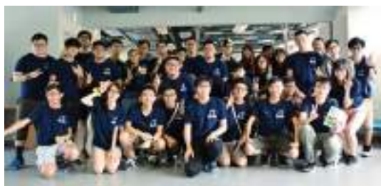
Group photo of freshmen, helpers and society members 新生、迎新營工作人員及系會成員合照