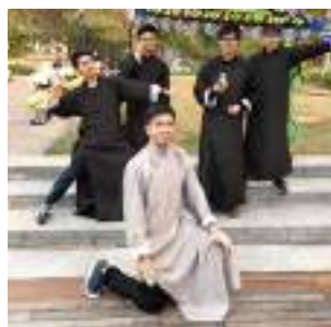
Kung-fu Students 功夫小子

2018 年 1 月 20 日，土木工程學系的同學應邀出席了香港建造商會青年會七週年晚宴，並配合大會主題，喬裝為功夫人物。