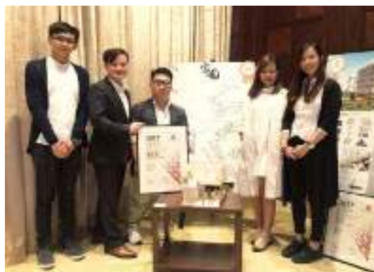
Design Submission 提交的設計