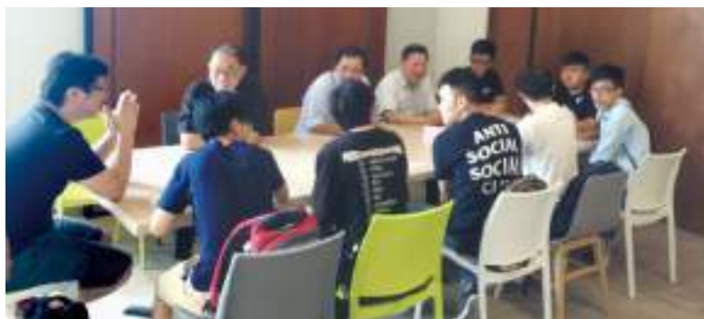
Professors brief the freshmen about the Department during lunch 教授們向新生介紹學系

A lunch gathering and laboratory tour were arranged after a briefing.