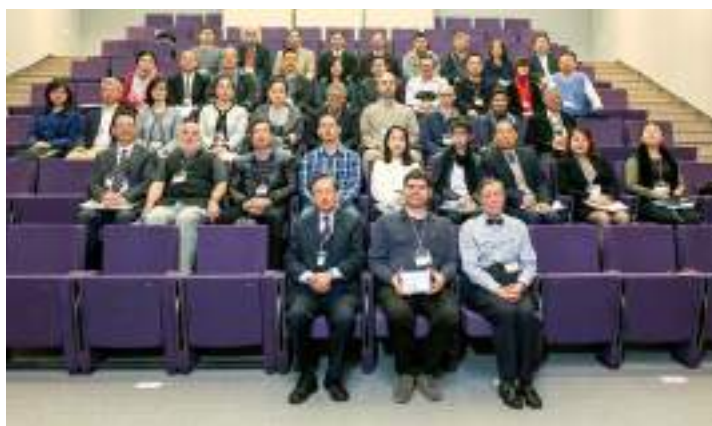
Conference group photo 研討會合照

The Research Centre for International Trade and Business is funded by the Institutional Development Scheme (IDS) through the Research Grant Council (RGC). It aims to promote a research culture and to engage in projects relating to various fields of international trade and business, either independently or in collaboration with researchers and academic scholars overseas.