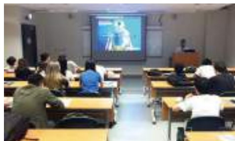
ICE HKA G&S introduces their objective to the students 土木工程師學會香港分會畢業生及學生部代表向同學介紹學會宗旨

講座目的是向土木工程學系的同學介紹土木工程師學會，以及推廣分會將舉行的活動。同學於最後的答問環節向學會查詢有關報考特許工程師的資訊。