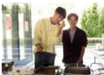
The Korean exchange students are good cooks. 韓國交換生煮出美味韓食