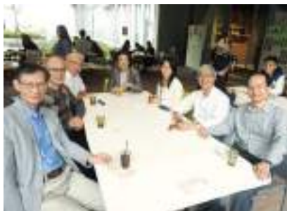
Staff socialise with one and other. 互相聯誼。