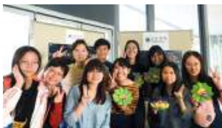
Staff and students making a floating lantern. 學院師生製作水燈

2017/18 學年第一個學期，來自泰國及韓國的交換生為珠海學院師生安排了兩個文化活動。泰國交換生指導珠海師生製作水燈，而韓國交換生則為大家烹調兩道小吃。同學們，包括德國交換生在內，排成人龍領取食物，一試味道。