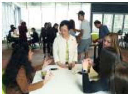
Chu Hai staff interact with three exchange students at the Happy Hour. 職員與三名交換生傾談。

From November 2017 to April 2018, the Student Affairs Office organised “Happy Hour” at the Glass Corridor twice a month for members of the Chu Hai Community, so that they could take a break from their busy schedule. The “Happy Hour” time enabled everyone there to have a very relaxing time by enjoying a cup of coffee and some snacks.