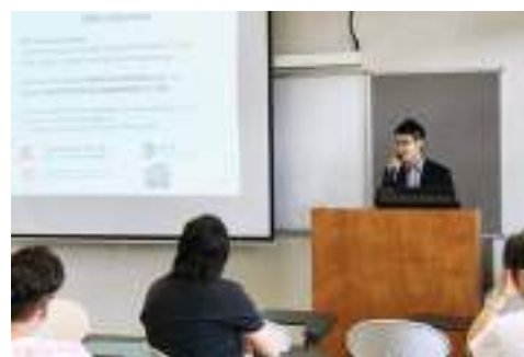
YMS council members introduce the Society to the students.