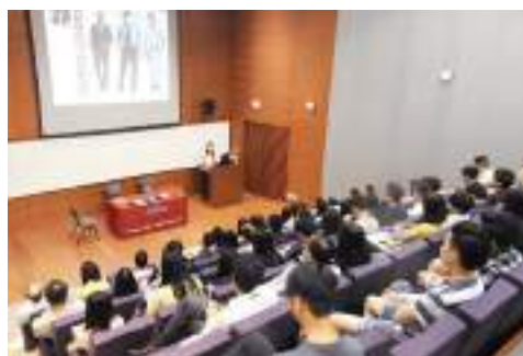
At the grooming workshop 「形象幫你贏好工」工作坊

In April 2018, a workshop on dining etiquette was held at the Glass Corridor. Participating students learned how to dine in the proper way. A career fair, a CV Clinic and a career consultation were also provided in the same month.