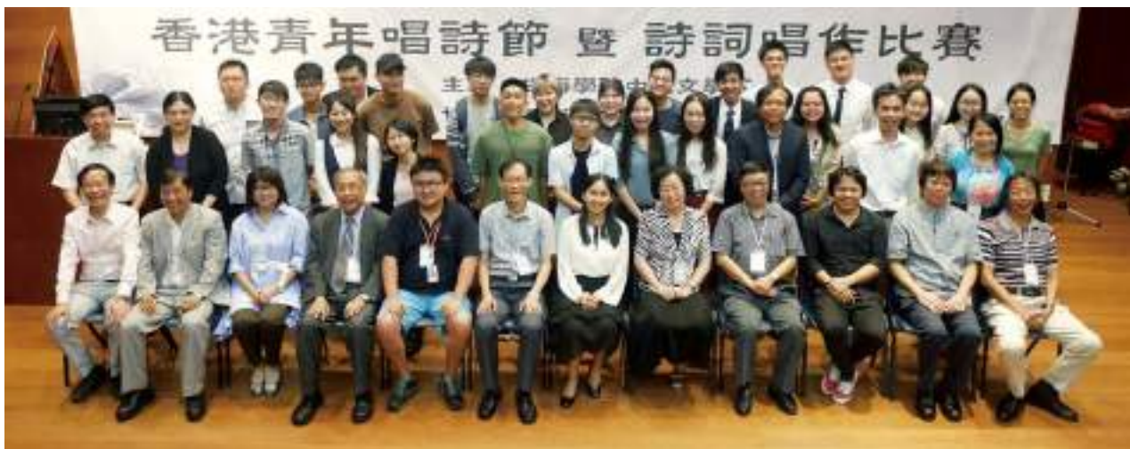
Guests and contestants at the Poems Chanting Festival 唱詩節嘉賓與參賽者

In mid October 2017, students of the Department organised a “Paper Cutting Workshop” jointly with the Chinese Departments of a number of universities. The event took place in the Centenary Campus of the University of Hong Kong.