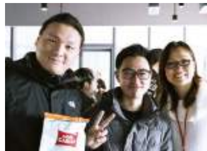
Happy faces at Happy Hour. 在 Happy Hour 展現笑容。