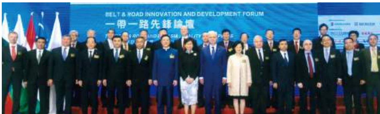
Belt & Road Innovation and Development Forum: The Belt & Road and Eurasia: Reality & Prospects 3 November 2017, Hong Kong

此外，題為「烏茲別克發展新階段」的論壇於 2018 年 1 月 10 日舉行，參加者超過 100 名。