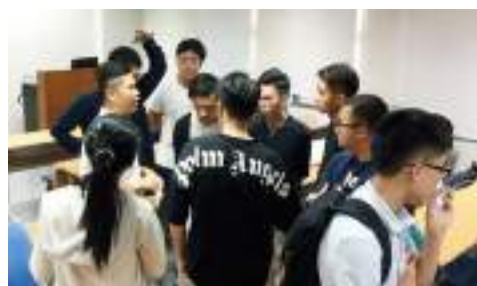
Q&A session 問答環節