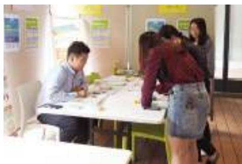
Career consultation 個人職業諮詢

2018 年 4 月的活動有餐桌禮儀工作坊、招聘會、即場履歷指導及個人職業諮詢服務。