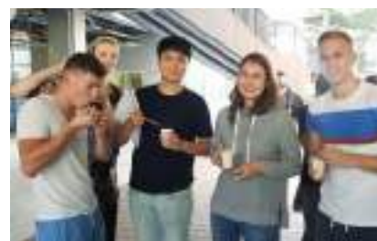
Exchange students from Europe enjoying tasty Korean food. 來自歐洲的交換生在享受韓食