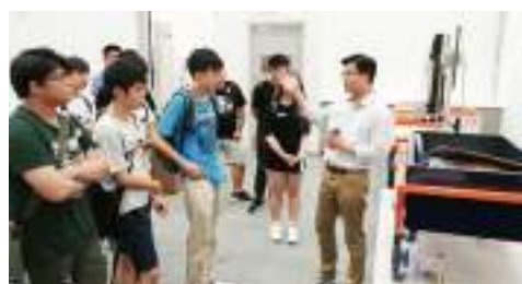
The students tour around the laboratories 新生參觀學系的實驗室

早上介紹會完結後，師兄師姐們帶領新生與系主任及老師共進午餐，並安排飯後參觀實驗室。