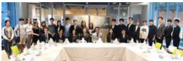
Dining etiquette 餐桌禮儀