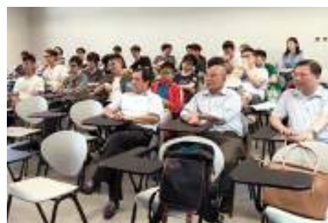
Some professors also participate in the talk. 教授們一同出席講座。